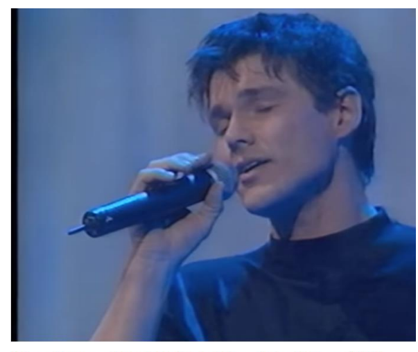
A-ha - Summer Moved On (Nobel Peace Prize Concert 1998)

"A-ha" is one of the most famous groups on the planet. At the beginning of the 90s, the team had a colossal success; tickets for their concerts were sold quickly, especially abroad. The musicians were even mentioned in the Guinness Book of Records since they sold about 200 thousand tickets at the festival show "Rock in Rio II" held at a stadium in Maracana, Brazil. In 1998, the group perfectly performed at the Nobel Prize Concert with the single "Summer Moved On". The track was famous in Europe, with more than two million copies.